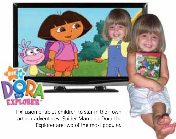
PixFusion enables children to star in their own cartoon adventures. Spider-Man and Dora the Explorer are two of the most popular.